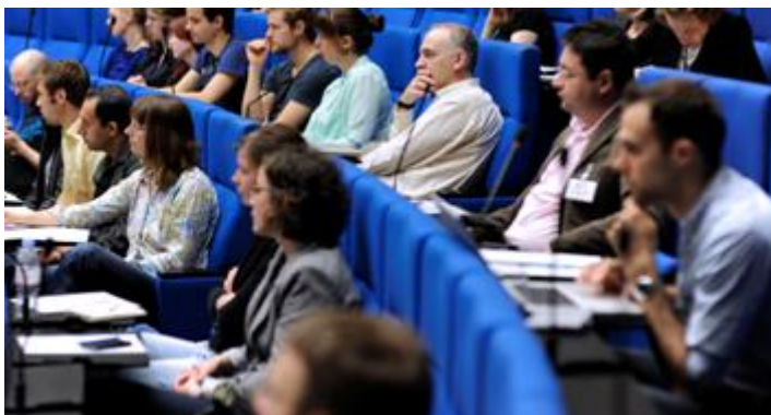
During the talk sessions.